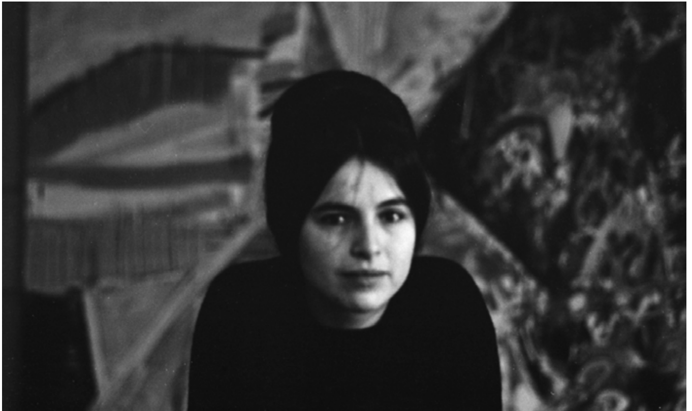
Eva Hesse c. 1963

Eva Hesse's life story exudes drama. From escaping Nazi Germany at age two aboard one of the last Kindertransport trains bound for the Netherlands, to her emphatic break with the dominant mode of art making of the 1960s — Minimalism, to her death from a brain tumor at 34, and to her posthumous celebration as one of the most important artists of the second half of the 20th century, her biography has all the requisite elements of a rousing documentary or tear-jerking biopic.