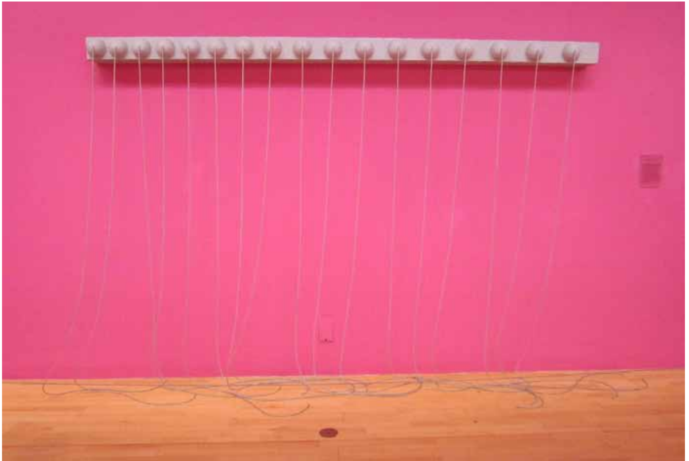
Eva Hesse, “Addendeum” (1967) on view at Tate Liverpool in 2012

BS: It’s interesting what you just said about making a point of going the extra step to see the works in person and film them; her work seems, more so than a lot of other contemporary artists, like the type of artwork that you need to see in three-dimensional space, and showing it on film seems like a perfect way to give people a sense of what is so unique about it.