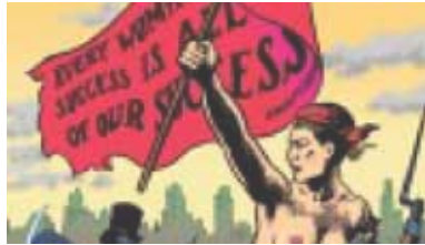
Can You Name Three Women Artists?