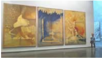
Museums Get Creative with Their Permanent Collections

Eva Hesse premieres at the Whitney Museum of American Art (99 Gansevoort Street, Meatpacking District, Manhattan) on May 17 at 2pm.