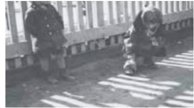
Something Special About Her, Eva Besnyö at the Jeu de Paume