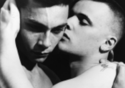
THE ANGELIC CONVERSATION